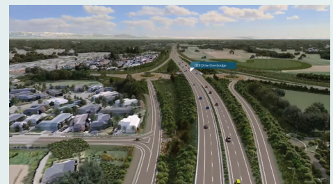
Artist's impression of the motorway going over QEI Drive. On the left, left-in and left-out access to Winters Road is visible.