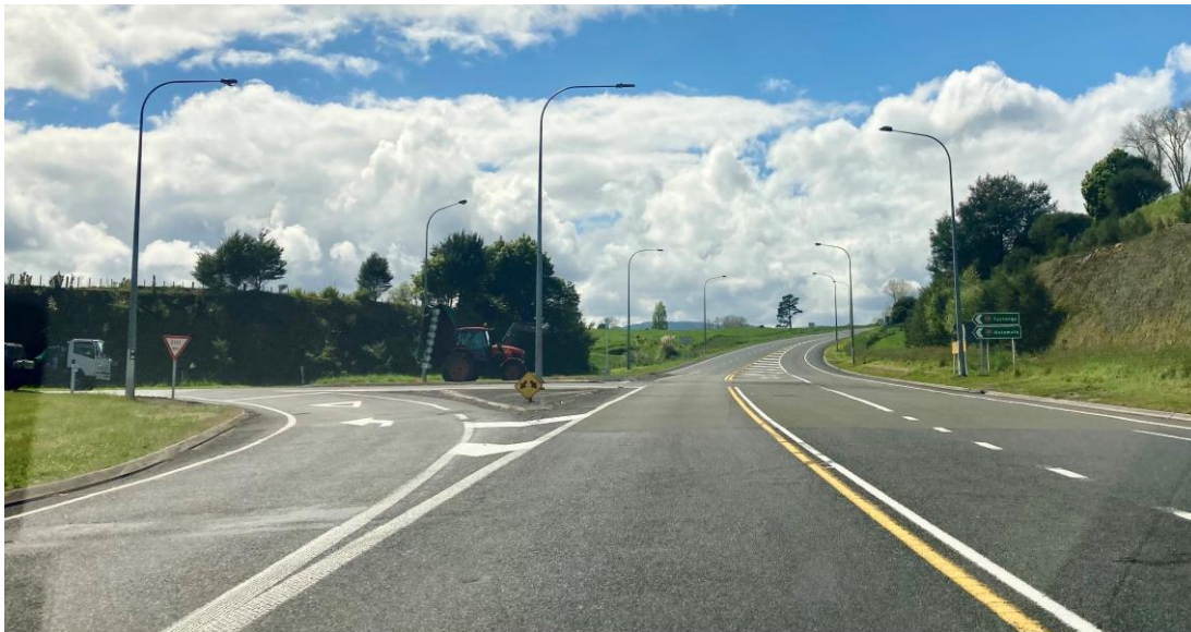
SH5 and SH28 intersection, Harwoods Road.