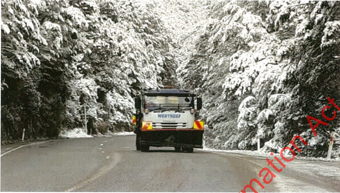
Reefton – September 2019

Released under the Official Information Act 1982